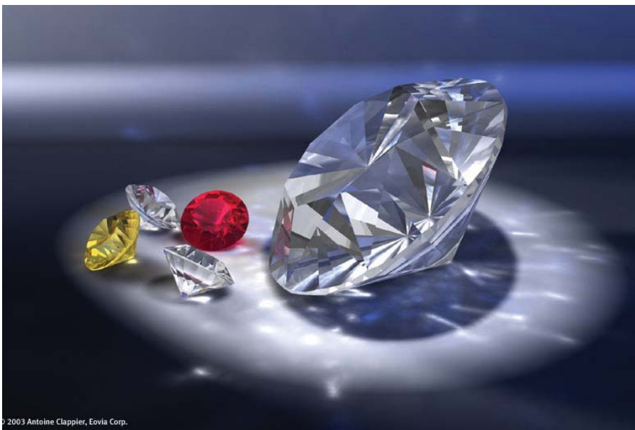
© 2003 Antoine Clappier, Evovia Corp.

• StratfordInnAshland.com Online Reservations Available